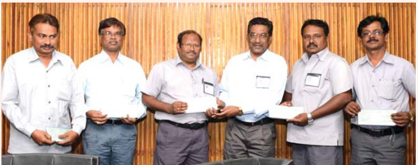
Ukkuvani congratulates all the team members, HoDs and MS dept. for the initiative of Value Engineering projects implementation.