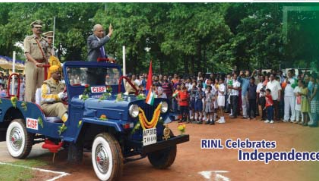
RINL Celebrates Independence Day