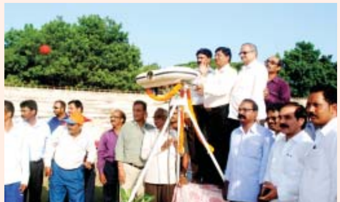
D(P) inaugurated the Bowling machine for VDCA Steel Zone under-13 years boys Academy at Col.C.K.Nayudu Ukku Stadium.