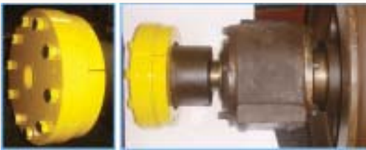
A Back plate made with bolting ring (Split ring) and attached to the coupling.

Twin table car is used to transport blooms from continuous casting department to Bloom Storage Yard (BSY). Torque is transmitted to the wheel axle through a vertical gear box. Every TTC has 2 motors one at each axle. The breakdown of car due to failure of track wheel & axle assemblies is restored by timely replacement with new or repaired units. No hurdles were faced for all the activities except for dismantling activity of coupling. As there was a marginal gap between coupling and axle box, conventional and plate pullers could not be accommodated for dismantling the coupling. Also the coupling flange being thin, pulled the coupling at flange leading to deformation/shearing of flange. Hence, only option left was destructive method of dismantling the coupling by lancing. This method increases the consumption of axles even though they are in good condition.