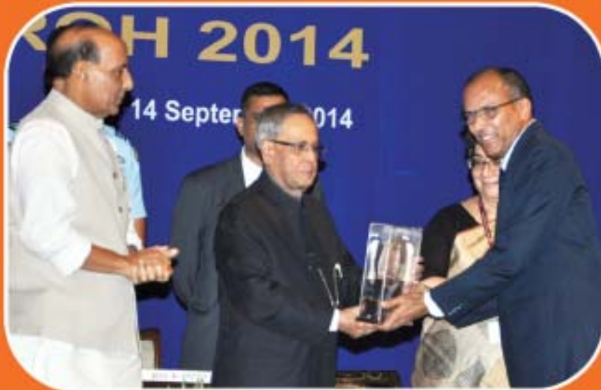
Hon'ble President of India presents Rajbhasha Shield to RINL