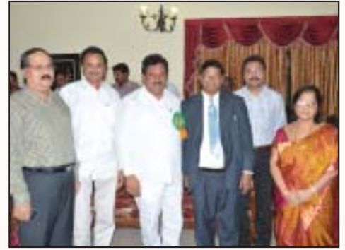
Shri Chinna Rajappa, Hon'ble Deputy Chief Minister, Govt of Andhra Pradesh with D(C) and D(P)