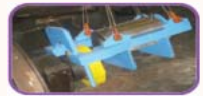
A Puller frame fabricated and Double acting hydraulic cylinder placed on it. The unit anchored and positioned to the job for dismantling coupling.

The team developed a solution with the minute study of each component and the functional requirement of them in the assembly. A back plate and split locking ring were made and fixed to the coupling flange. Coupling was dismantled by means of hydraulic puller, thereby applying the force at the flange. The deformation/shearing of flange were well arrested by resistance offered by back plate. The project resulted financial savings of ₹ 308824 /- per annum.