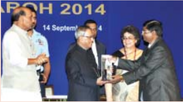
'saYalla' kaayah pirskar lagaatar tIsarl baar pãPt hiAa h0