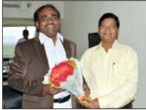
Sri Ravula Kishore Babu, Hon'ble Minister of Social Welfare, Govt of Andhra Pradesh warmly welcomed by Dr GBS Prasad, D(P)