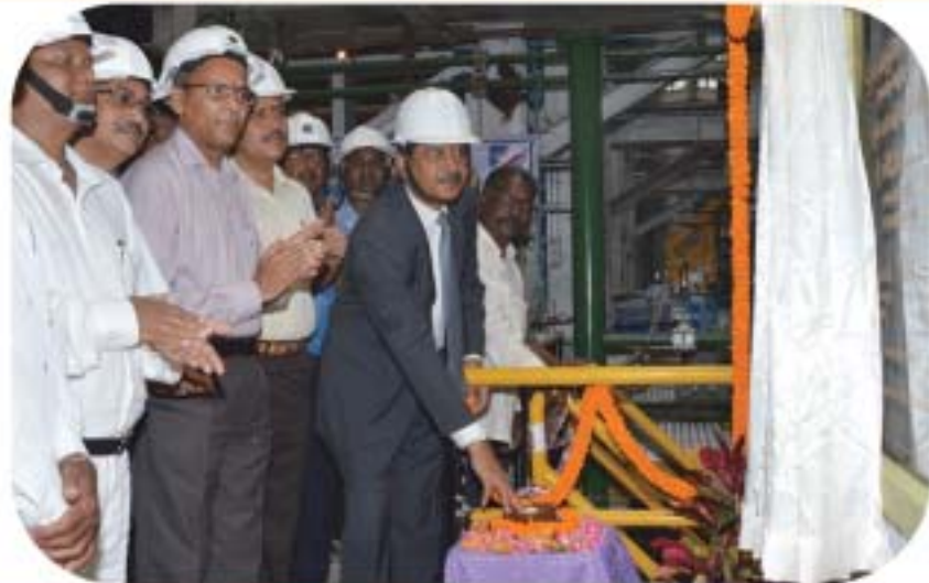
Steel Secretary commissions Reheating Furnace of New Structural Mill