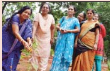
'GO Green Drive' by VMS