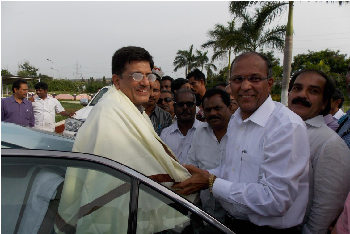
Photo Caption: Sri P Madhusudan, CMD, RINL extends warm welcome to Sri Piyush Goyal, Honourable Union Minister of Power during his visit to the plant.

Sri Piyush Goyal, Hon"ble Union Minister of Power, New & Renewable Energy, Coal and Mines today arrived on a maiden visit to RINL-VSP. Sri P Madhusudan, CMD, RINL accorded a rousing welcome on his arrival in the plant. Sri Goyal planted saplings on the occasion at the dedication Park. The Hon"ble Minister was accorded a guard of honour on the occasion.