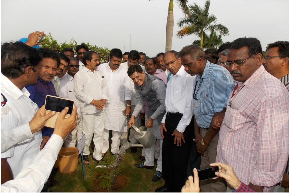
Photo Caption: Sri Piyush Goyal, Honourable Union Minister of Power planting a sapling at the Dedication Park. Sri P Madhusudan, CMD, RINL and others are seen.