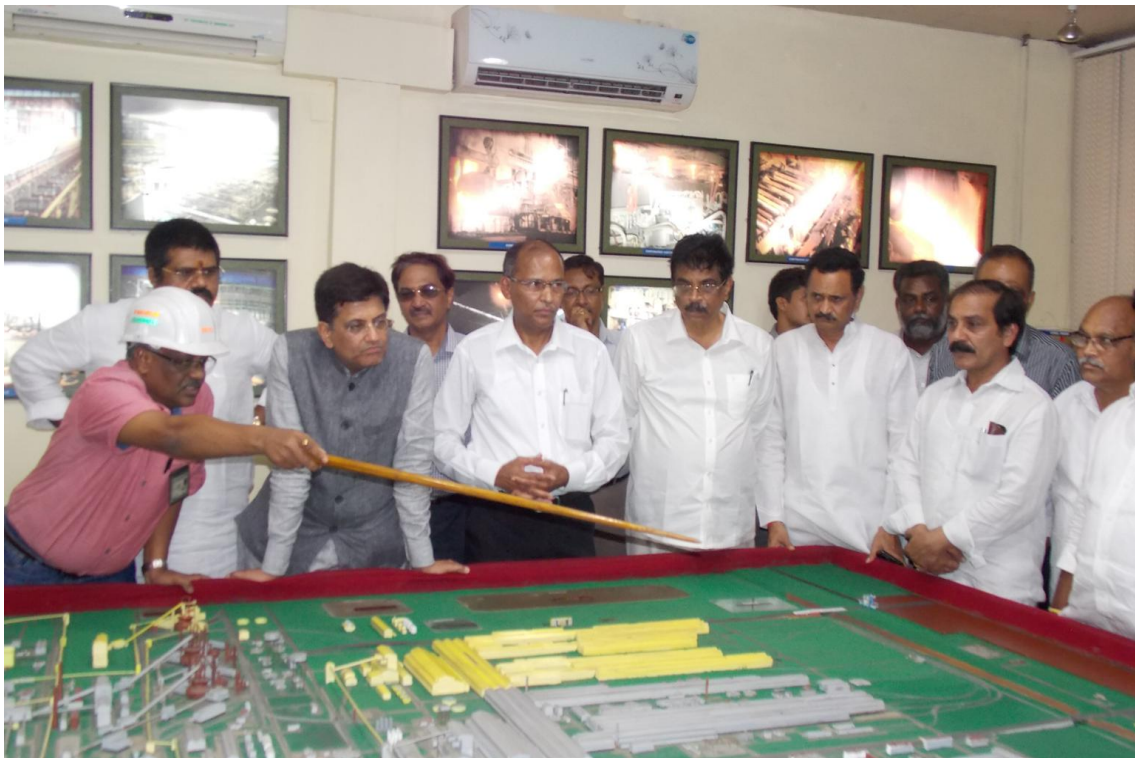
Photo Caption: Sri Piyush Goyal, Honourable Union Minister of Power is at the Model Room. Sri P Madhusudan, CMD, RINL and others are seen.