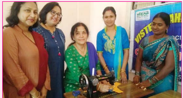
Inauguration of tailoring classes for the new batch at Desapatrunipalem.