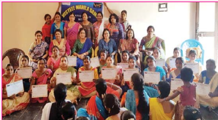
Certificates presentation to the women who had completed the tailoring course