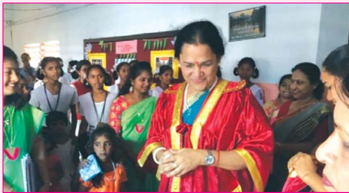
Graduation ceremony at Visakha Vimala Vidyalayam