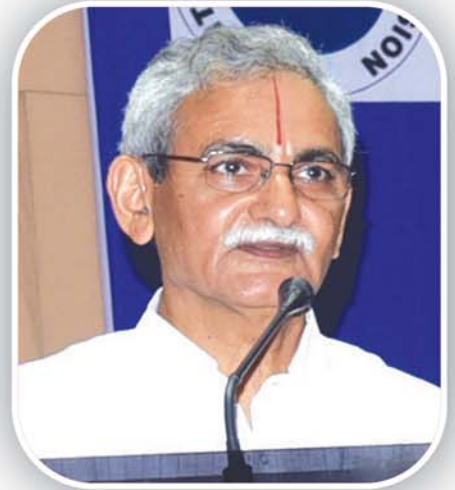
Central Vigilance Commissioner visits RINL