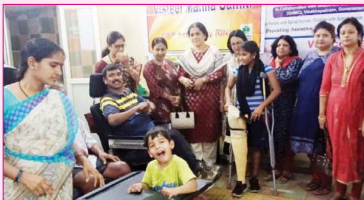
Artificial limbs distributed at Ability Rehabilitation Centre, Visakhapatnam