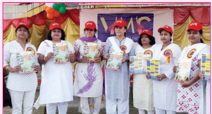
Release of “Spark Magazine”